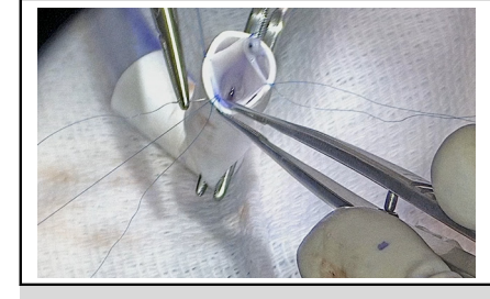
Femoral vein homograft reinforced with a PTFE conduit.

https://doi.org/10.1016/j.xjtc.2022.10.014