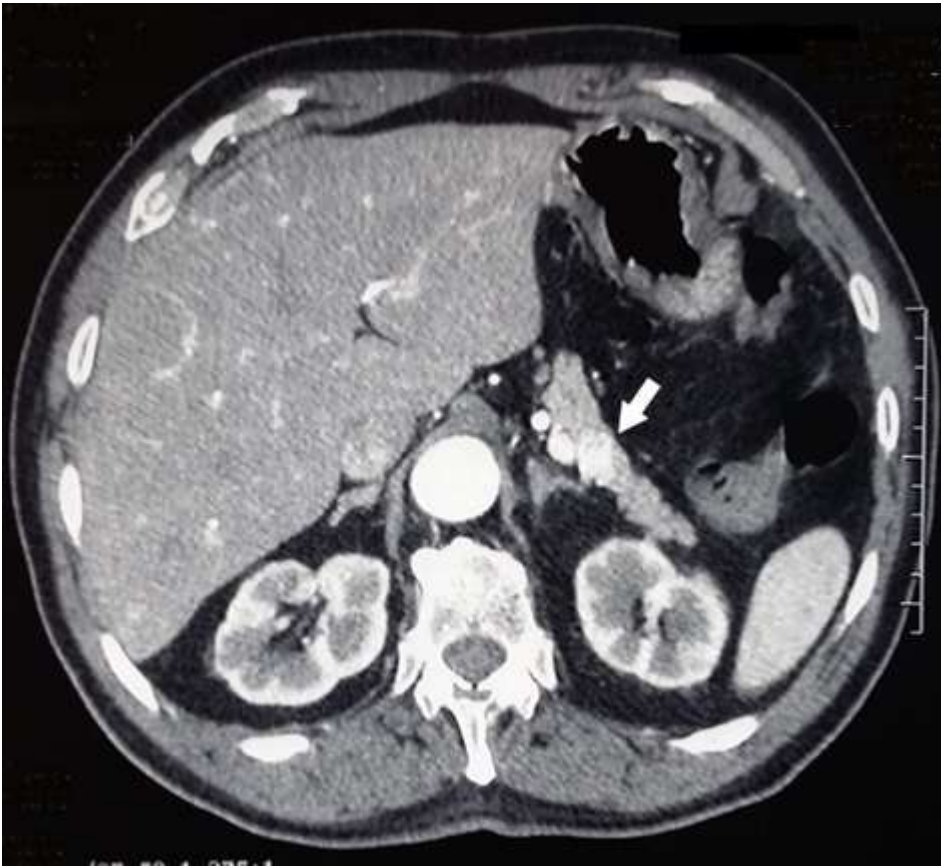
Figure 1: abdominal CT scan showed a hypervascular lesion of 20mm localized in the tail of the pancreas