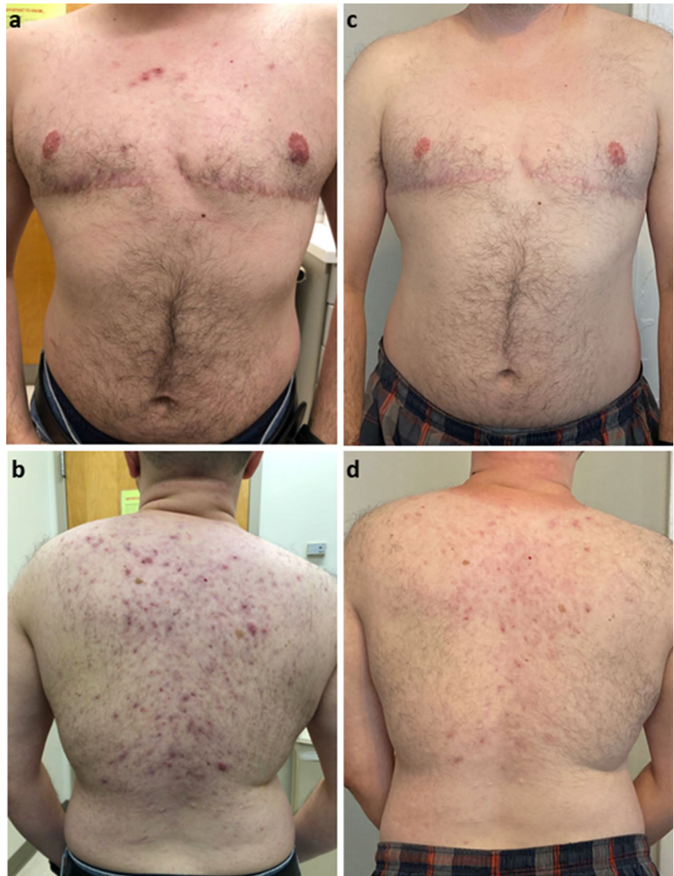
Fig. 2 Clinical appearance of acne in a transmasculine patient a, b before and c, d after isotretinoin treatment

discontinuation [38]. Therefore, dermatologists considering isotretinoin for a transgender patient should inquire about patient plans for gender-affirming surgeries [7]. Transmasculine patients often use the terms ‘top’ surgery to refer to chest reconstruction such as mastectomy, and ‘bottom’ surgery to refer to genital reconstruction such as metoidioplasty, phalloplasty, hysterectomy, and/or oophorectomy. Delay of isotretinoin treatment should be considered to avoid delays in gender-affirming surgical plans. Nevertheless, aggressive treatment of moderate-to-severe truncal acne, such as with oral antibiotics, may be required to reduce inflammation, reduce scarring, and optimize top surgery outcomes.