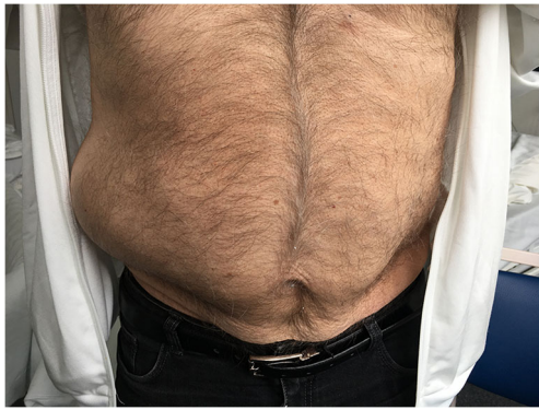
Fig. 1 Initial presentation of the patient with abdominal wall bulging right-sided