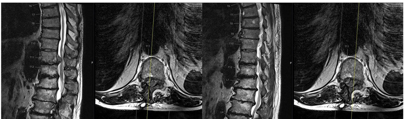
Fig. 5 MRI of the thoracolumbar spine T2 weighted 8 weeks after initial presentation with clinical bilateral thoracic abdominal wall bulging and a bilateral relapse of disc herniation Th11/12

There are several possible surgical approaches to treat thoracic disc herniation, depending on localization, calcification of the