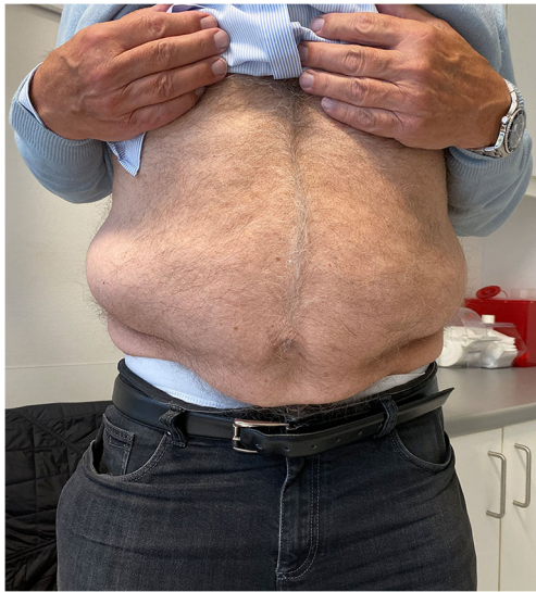
Fig. 4 In the clinical follow-up 8 weeks after the first operation, the patient presented with bilateral abdominal wall bulging