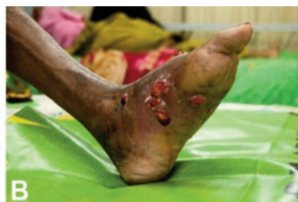
Figure 1. Extensive multiple draining sinuses of the lower limb typical of findings consistent with a diagnosis of Mycetoma. A) patient 2; B) patient 1.