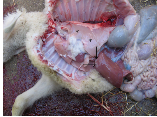
FIGURE 1: Necropsy revealed the presence of abscesses in the liver (arrows) and lungs of all five lambs necropsied. In the lamb shown here, extensive consolidation, mainly of the caudal portion of the lungs, was also observed (asterisks).

Other conditions that may cause illthrift in lambs are trace element and vitamin deficiencies [1, 8], nephrosis, lameness, coccidiosis, and other parasitic infections [3, 4, 7, 9]. The clinicopathological findings, as well as the parasitological examinations, excluded the presence of all these conditions. Cryptosporidiosis, which was initially diagnosed in this flock, has been reported as a possible cause of illthrift by some authors [10, 11]. Although our research group has not found any correlation of cryptosporidiosis, as an