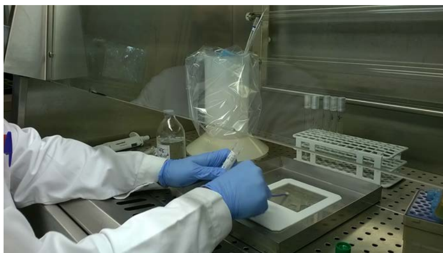
Figure 1. Surface sampling according to ISO 18593:2004 (ISO, 2004).

CFU, colony forming unit. Values are expressed as means of five replicates for each concentration considered in the trial.