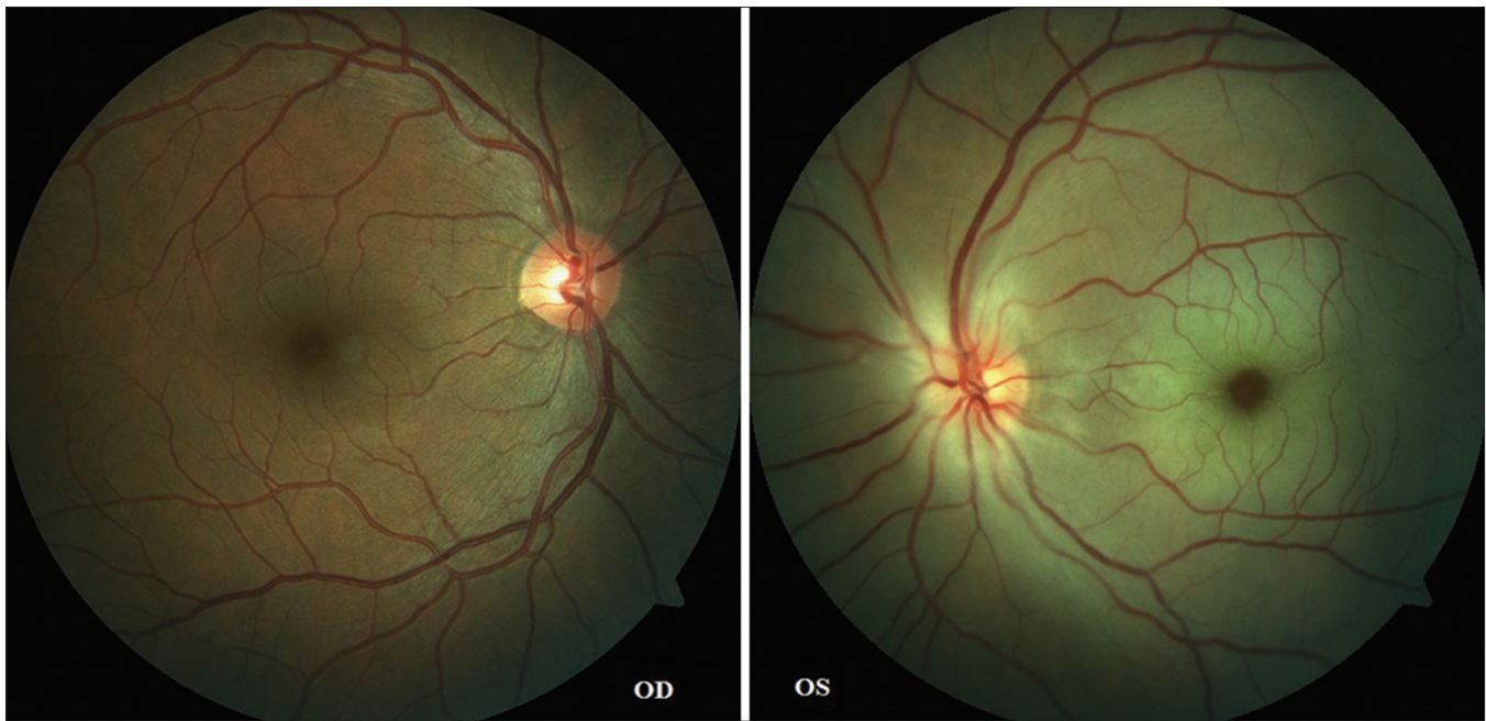
Figure 1: Fundus photo of a normal right eye and left eye with Disc edema, attenuated arteries, retinal whitening, and a macular cherry red spot