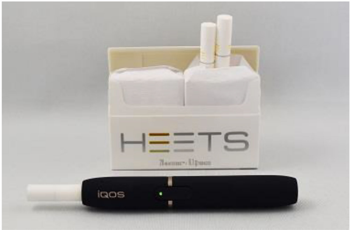
Figure 1: IQOS heated tobacco product device and tobacco sticks