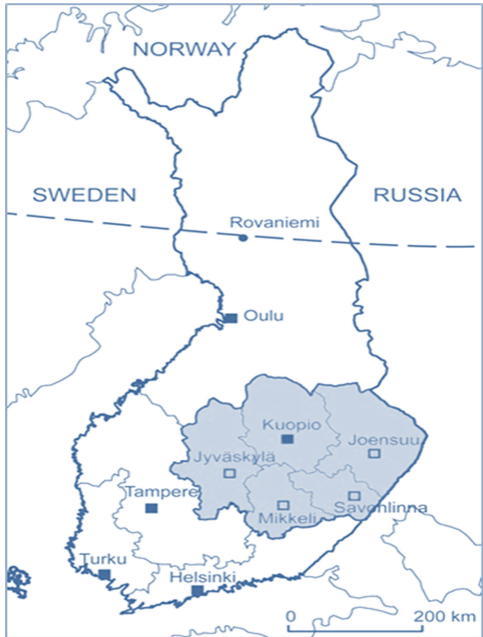
Fig. 1 Map of the catchment area of the Kuopio University Hospital (KUH), containing 4 central hospitals (Joensuu, Jyväskylä, Mikkeli, Savonlinna) with acute neurology and CT services. All patients with acute aSAH are referred to KUH Neurosurgery and KUH Neurointensive Care

KUH Neurosurgery and KUH Neurointensive Care have exclusively provided full-time (7 days, 24 h) acute and elective neurosurgical services for the KUH catchment population [8–10]. All cases of SAH diagnosed by CT or spinal tap are acutely transferred to KUH for neurointensive care, neuroradiology (4-vessel catheter angiography and/or CT angiography), and neurosurgical treatment.