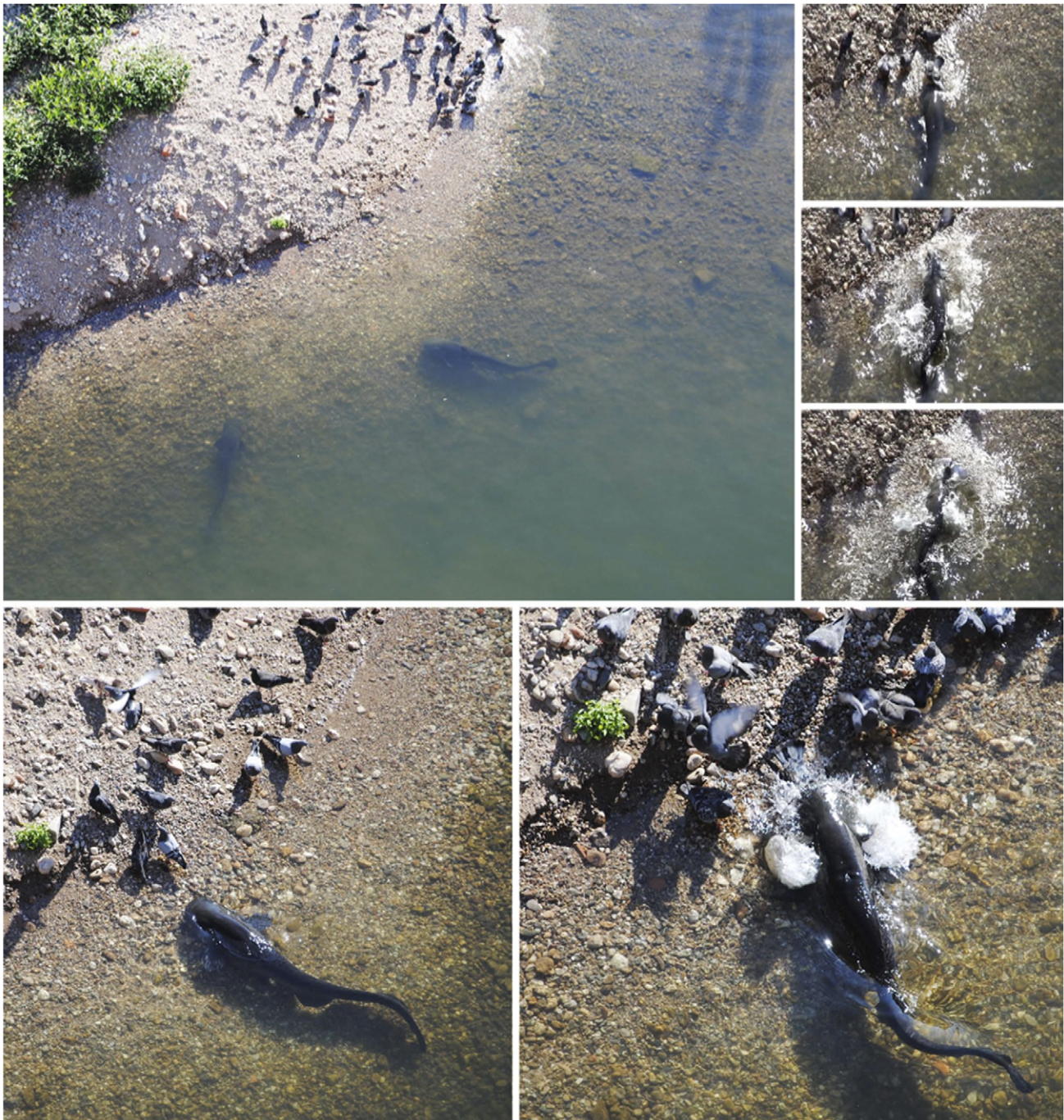
Figure 1. European catfish displaying beaching behavior to capture land birds. Several individuals were observed swimming nearby the gravel beach in shallow waters where pigeons regroup for drinking and cleaning (large picture). One individual is seen approaching land birds and beaching to successfully capture one (small pictures). doi:10.1371/journal.pone.0050840.g001

gravel island. Throughout the survey, river discharge was low and the water was clear, allowing full observation of all displayed behavior (Figure 1 and Movie S1).