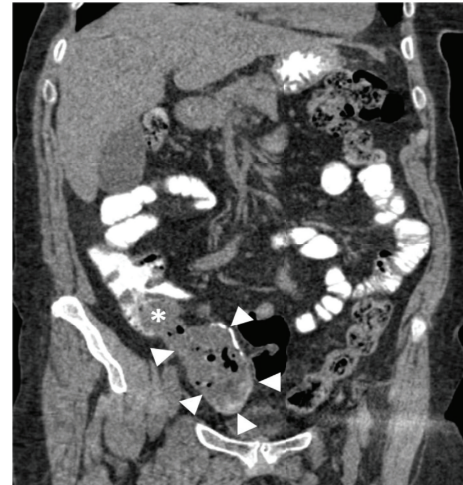
FIGURE 1: NECT-coronal MPR, showing the lesion (white arrowheads) in continuity with the cecum (asterisk).

We presented the diagnostic and therapeutic approach in the emergency setting of a case of a giant appendiceal mucinous neoplasm presented as acute appendicitis in an elderly patient. Appendiceal mucinous neoplasms can be presented as acute appendicitis in only 8% to 14% of the cases [3, 10]. Furthermore, only 5–10% of cases of acute