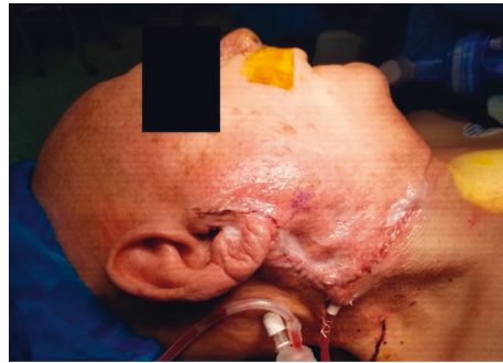
FIGURE 2: Wound closure after volume restoration.