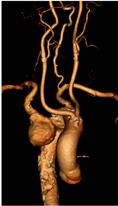
Figure 1: Computed tomography (CT) reconstruction illustrating Kommerell's diverticulum and an aberrant right subclavian artery.