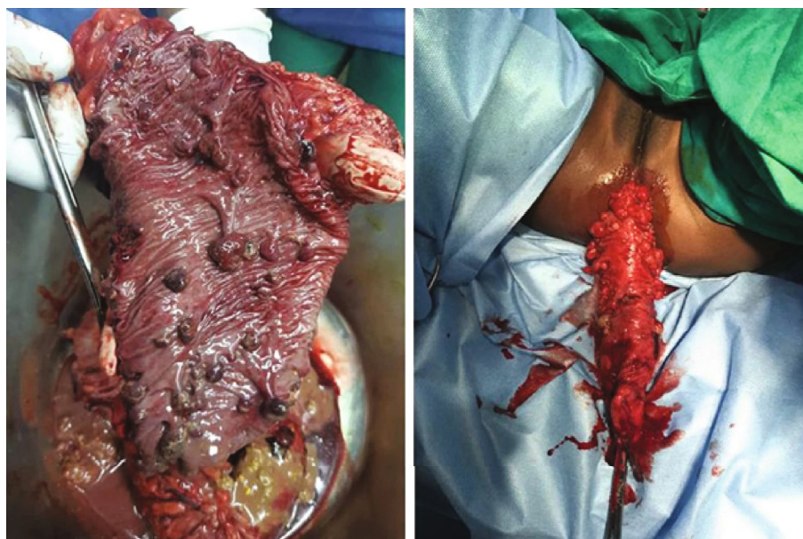
FIGURE 3: Photograph taken during surgery showing polyps in the colon.

Cowden Syndrome (CS), and Bannayan Riley Ruvalcaba Syndrome (BRRS), and juvenile intestinal polyps are present in all [5]. Juvenile polyposis syndrome can further be clinically subdivided into Juvenile Polyposis of Infancy, Juvenile