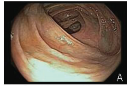
A- Endoscopic image without chromoscopy

79% and 77%, respectively, for NBI and 89%, 96% and 93%, respectively, for WLE. Our experience using underwater NBI showed that water immersion resulted in better demarcation of SSAs and contributed to a low incidence of residual lesions. One limitation of our study was a lack of long-term endoscopic follow-up. In addition, although this finding was not directly related to the objective of our study, none of 5 patients that returned for follow-up