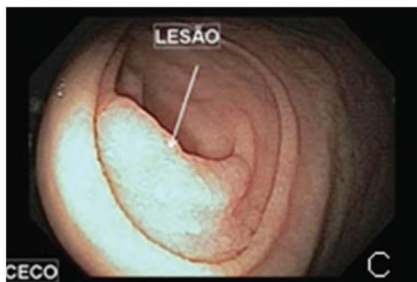
C- Endoscopic image after the lesion was washed with water