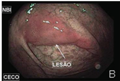
B- Image obtained using NBI prior to washing of the lesion