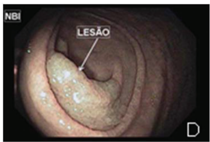
D- Endoscopic image using NBI after the lesion was washed with water