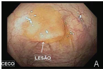
A- Image of the lesion with a pronounced mucus cap on its surface