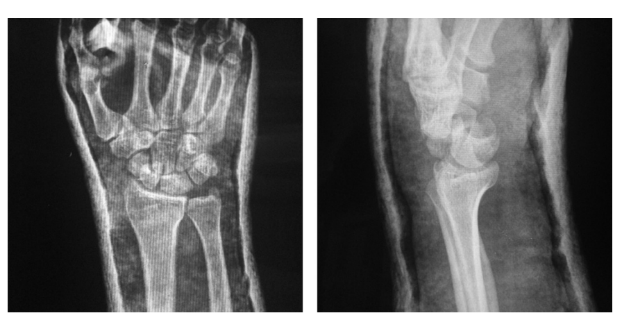
Fig. 2. A 35-year-old male with right transscaphoid dorsal perilunate fracture dislocation. Initial diagnosis was scaphoid fracture and treatment was thumb spica cast immobilization.

In a comparison of the cause of injury, associated fractures, polytrauma, injury type, radiographical assessment and Herzberg classification, there were no significant differences between groups. There was also no statistically significant difference in the time until hospital presentation (Table 1).