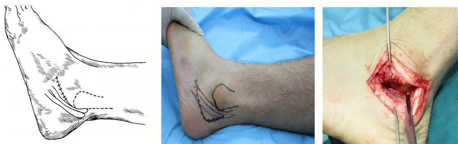
Figure 1 An approach from the inferior tip of fibula to the basilar part of the fourth metatarsal bone and its exposure area.

The following scoring criteria of subtalar joint exposure area during operation were used: the posterior subtalar articular facet was quartered and observed via the approaches; 10 scores: 4/4 exposure, 7 scores: 3/4 exposure, 5 scores: 2/4 exposure, 3 scores: 1/4 exposure, and 0 score: 0/4 exposure. The exposure time was recorded after the start of operation, i.e., time from skin incision to subtalar joint exposure (precision: 1 min). And the intraoperative bleeding volume was recorded with the planimetry (i.e., 1 cm 2 blood-wetted gauze indicated 1 ml bleeding).