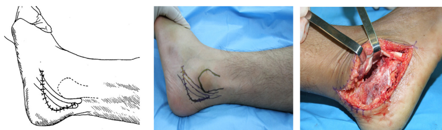
Figure 3 A posterior-lateral L approach and its exposure area.