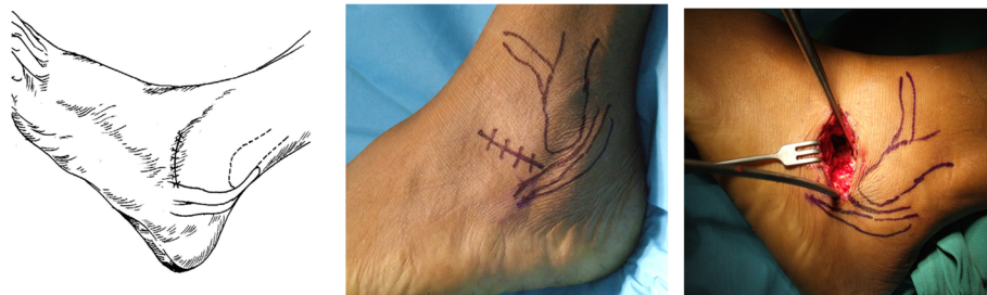
Figure 2 A lateral tarsal sinus approach and its exposure area.

Totally, 102 patients with severe subtalar arthritis were included in this study, including 56 cases of traumatic arthritis, 16 cases of rheumatoid arthritis, 17 cases of osteoarthritis, 10 cases of subtalar joint tuberculosis, and 3 cases of talocalcaneal coalition. There were 64 males and 58 females, with an age of 16 to 74 years (mean: 43.2 \pm 3.6 years) and a course of disease before operation being 1 to 360 months (mean: 38.0 months). There were no statistically significant differences in general data among group A ( n = 34), group B ( n = 32), and group C ( n = 36) ( P > 0.05), while the general data of the three groups were comparable, as shown in Table 1.