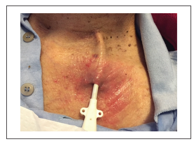
Figure 2. Exit-site infection.

Note. CDC = Centers for Disease Control and Prevention; CRBSI = catheter-related bloodstream infection; BC = blood culture.