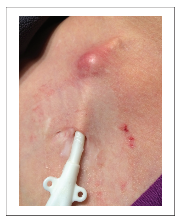
Figure 3. Tunnel infection.