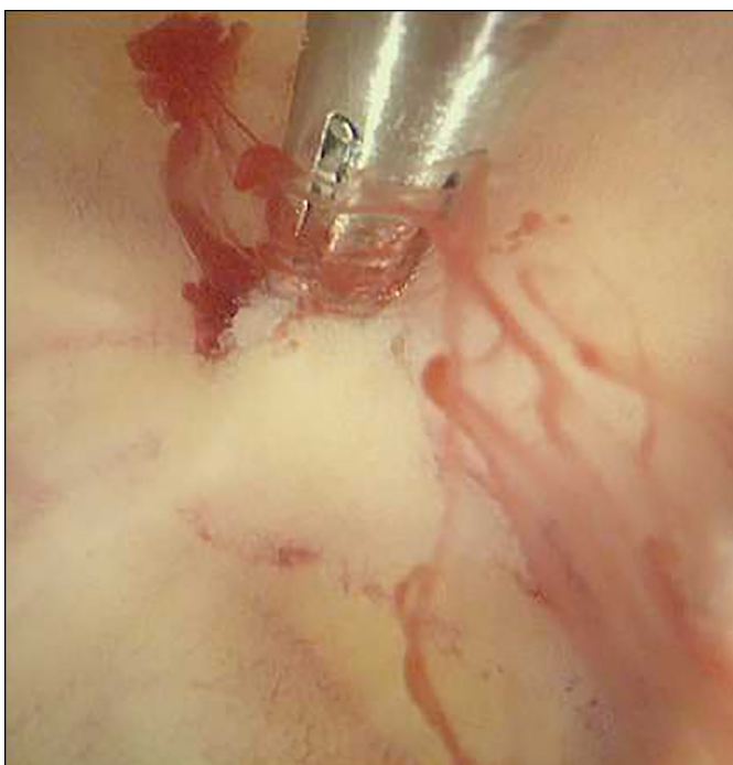
Figure 2. Clip at base of bleeding jejunal diverticulum.

Case 2: A 67-year-old woman was admitted to our hospital for pre-syncope, abdominal pain, and melena. She had been taking high doses of aspirin for several weeks prior to this admission. A few days prior to admission, she developed