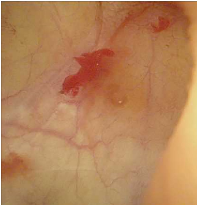
Figure 1. Push enteroscopy showing an actively bleeding diverticula in the proximal jejunum.

Case 2: A 67-year-old woman was admitted to our hospital for pre-syncope, abdominal pain, and melena. She had been taking high doses of aspirin for several weeks prior to this admission. A few days prior to admission, she developed