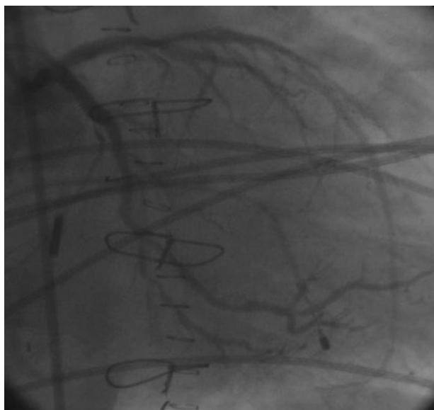
Figure 3. PCI of LMCA, proximal LAD and proximal circumflex.

condition with blood pressure at 90/60 mm Hg, and an acceptable diuresis of 35–40 cc/hour. PCI was delayed due to the critical hemodynamic status, nevertheless it was successfully performed 18 hours later. It consisted of LMCA, proximal LAD, and proximal circumflex angioplasty/stenting (Fig. 3) using T-stenting technique (Everolimus drug eluting stents) with end kissing balloon angioplasty. Over the next 48 hours, the patient’s hemodynamic condition progressively improved and stabilized, positive inotropic drugs were progressively withdrawn, intra aortic balloon was removed, and the patient