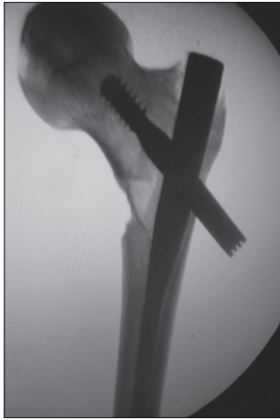
Figure 4: Fluoroscopic view showing this bone implant construct fixed with Gamma nail showed backing out of lag screw after 28,000 cycles. there is also displacement at the fracture site suggesting increased subsidence.this concludes Gamma nail is less stable in comparison to Gamma nail in unstable trochanteric fractures