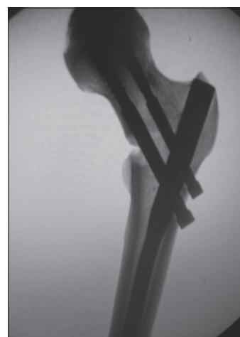
Figure 2: Fluoroscopic view showing specimen of cadaveric femur fixed with PFN and made unstable after creating posteromedial defect. This bone implant construct is mounted on MTS machine and tested with 200 kg load and 50,000 cycles