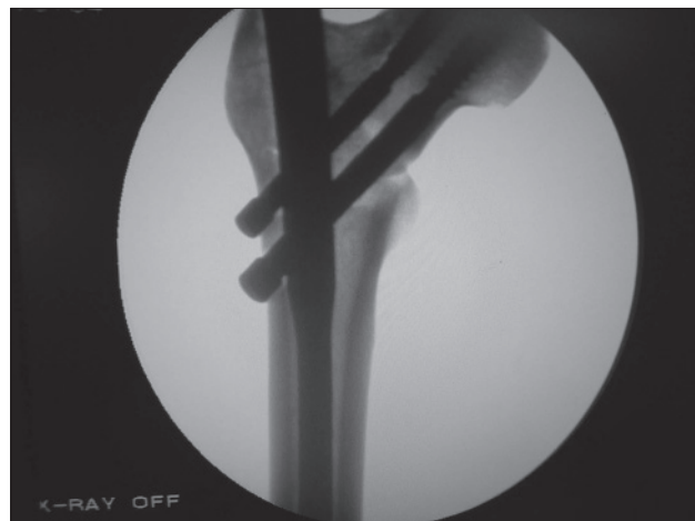
Figure 3: Fluoroscopic view showing this bone implant construct fixed with pfn remained stable after testing for 50,000 cycles with a load of 200 kg. this shows pfn (double screw device) provide greater fixation stability and minimal subsidence. there is no migration of screws

completed 50,000 cycles and five constructs failed [Figures 4 and 5] in the Gamma nail group [Tables 5 and 6]. There was a significant difference found between both the groups ( P = 0.046). Though the bone quality as assessed by DEXA was comparable in both PFN (0.85 ± 0.10) and the Gamma nail group (0.80 ± 0.10); ( P = 0.374),