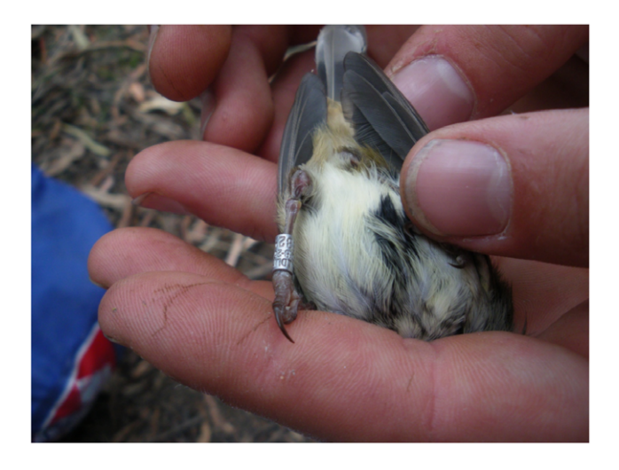
Figure 4. Injuries on Brown Thornbill legs caused by plastic colour ring in upper position. Since Brown Thornbills in Tasmania often forage hanging upside down, the plastic ring is pushed onto the tibo-tarsal joint, causing a severe infection in 3% of birds, and loss of a foot in 1%. This individual was initially colour ringed on 13 December 2010, and recaptured to remove the colour rings on 9 April 2011. doi:10.1371/journal.pone.0051891.g004

individuals which we were unable to catch, of which two had swollen legs. In total, of the 314 birds ringed between December 2009 and December 2010, 1% of birds lost one limb, and 2% had swollen legs.