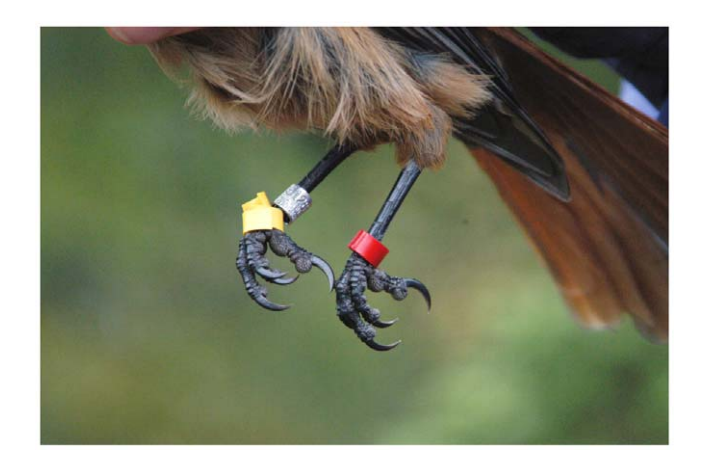
Figure 2. Siberian jay with partly unwrapped wrap-around colour ring stuck over the foot. The yellow plastic ring was mounted on top of the metal ring but slipped over the metal ring when the bird tried to remove the plastic ring. This individual was colour ringed as a juvenile in autumn 2002, and recaptured in October 2003 with the colour ring partly stuck over the foot. It subsequently dispersed in spring 2004 to the neighbouring group where it became a breeder.

split rings (PVC or celluloid, internal diameter = 2.3 mm), one above the metal and two on the other leg, but subsequently