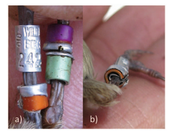
Figure 5. Brown Thornbills with damaged aluminium rings which have been mounted on top of each other. Individual a) was ringed in September 2007 and re-captured the beginning of October 2008 to remove the aluminium rings and mount plastic split rings instead. The bird was still alive in August 2012. doi:10.1371/journal.pone.0051891.g005

(2.14\pm0.02 \text{ mm}) fell between these two ring size diameters. Switching to the larger ring size dramatically reduced injury rates: over the remaining five years of the study when all birds were censused weekly, 0.04% (one male, one female) of 460 birds ringed with size 02 metal rings developed injuries on the leg with the metal ring (excluding birds ringed as nestlings that did not survive to independence at 12 weeks of age, none of which developed injuries).