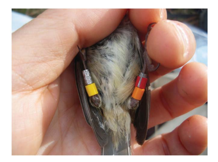
Figure 1. Brown Thornbill where the leg on the right of the picture is ringed with a metal-on-plastic ring, with the metal protruding so the plastic does not make contact with the foot. Thornbills are known to react negatively to plastic colour rings that touch the feet. While the metal-on-plastic ring method solved this problem, Brown Thornbills on Tasmania reacted to plastic colour rings in upper position (see Fig. 4).

2. Siberian Jays. Siberian Jays were studied from 1989 onwards by Jan Ekman (Uppsala University, Sweden), Michael Griesser and colleagues to investigate the evolution of family living and the interplay between habitat structure, nest predation and population dynamics [21,22,23] (under the licence from Umeå djurförsöksetiska nämnd license numbers A80-99 and A504). The study site near Arvidsjaur, Sweden ( 65^{\circ}40'N , 19^{\circ}0'E ) [21] is about 100 km south of the Arctic Circle, and has a mean annual rainfall of 650 mm, a mean minimum temperature of -18^{\circ} C during winter (with temperatures down to -50^{\circ} C), and a mean maximum temperature of +18^{\circ} C during summer. The vegetation at the study site consists of a mosaic of managed and unmanaged northern boreal forest [24]. Fieldwork took place during most months, with a focus on the reproductive season (March–May) and autumn (September–October).