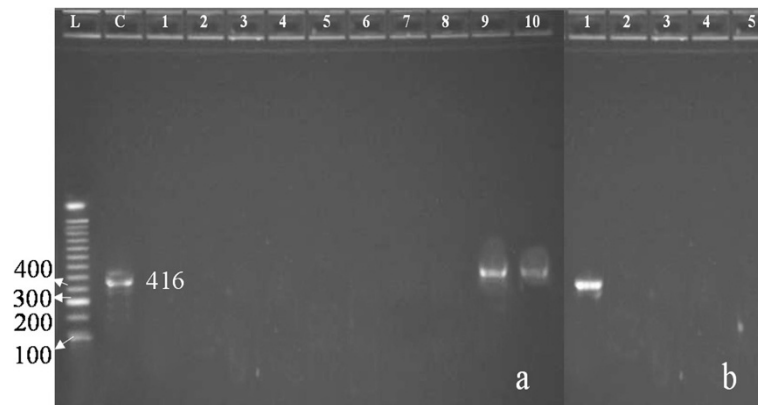
Figure 2 Single PCR product (416 bp) in wells labelled as c (control), 9a ( L. acutangula ), 10a ( C. pepo ) and 1b ( M. piperita ), evidencing the presence of HAV in vegetables sampled from Bajowro kale near Takht Bhai. Agarose gel shows RT-PCR results of different vegetable samples. No PCR product was detected in vegetables collected from Location 1 (1a, Cauliflower; 2a, tomato; 3a, Ridge-gourd ), Location 2 (4a, Brinjal; 5a, Ridge-gourd; 6a, Pumpkin), Location 4 (7a, Bittergourd; 8a, Pumpkin), Locaton 5 (2b, Bittergourd; 3b, Pumpkin), and Location 6 (4b, Pumpkin; 5b, Ridge-gourd).

pepo and L. acutangula were collected from this area. No band corresponding to HAV RNA was detected on the gel indicating that the vegetables collected from this area were free from HAV contamination.