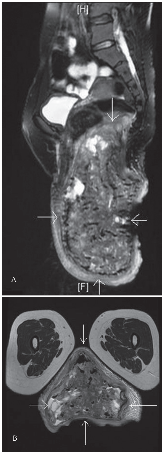
Figure 1. Sagittal and axial MR images showing an irregular, lobulated, multicystic soft tissue mass near the coccyx extending to the perineum.