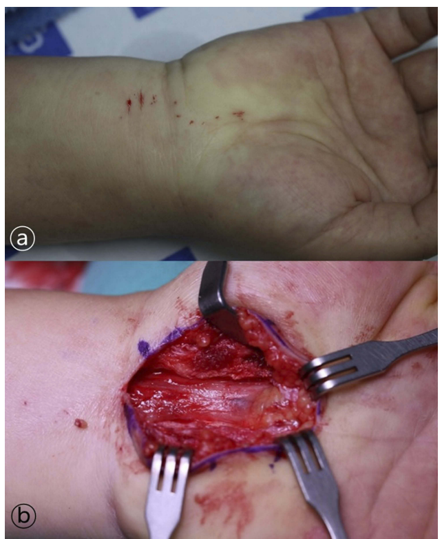
Figure 2 (A) Injection was performed considering an incision as long as possible. (B) After incision of about 3 cm, we released total transverse carpal ligament.

Injection pain, perioperative pain, and postoperative pain were assessed using a 10-point pain VAS. VAS scores were measured in the ward up to 24 hours after surgery, at home at 48 and 72 hours, and at the follow-up visit 1 week after the operation. Patients knew that the surgeon could not see individual responses to questions and that results were aggregated by the third (blinded) person. The time to the procedure (skin incision to last suture) and any adverse events were also recorded. In OCuTR, functional outcome using the "quick" Disabilities of the Arm, Shoulder, and Hand (DASH) questionnaire<sup>6</sup> was evaluated preoperatively and at 3 and 12 months postoperatively. Hand grip and key pinch were also measured using a dynamometer (Jamar pinch gauge; Asmow Engineering, Los Angeles, CA, USA). In OCTR, subjective outcome was assessed before surgery and at 6 months postoperatively by trained nurses using the Korean version of the Michigan Hand Outcomes Questionnaire (K-MHQ). Statistical analysis was performed using SPSS. Mann-Whitney U, \chi^2 , Fisher's exact, and ANOVA were