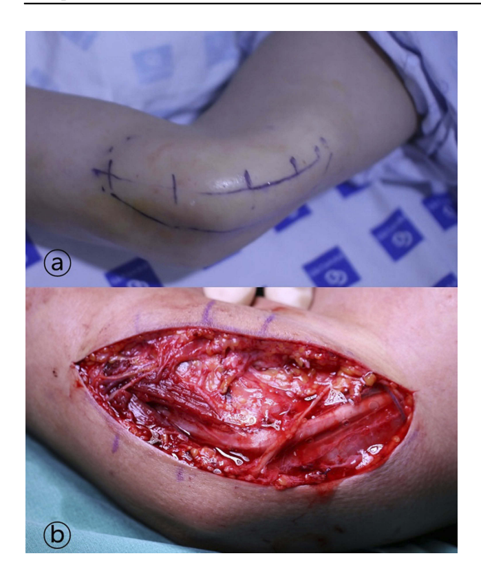
Figure 1 The anesthetic solution was injected a minimum of 30 minutes before surgery.

Notes: ( A ) Injection was performed considering an incision as long as possible. ( B ) After incision of about 7 cm, we released from proximal arcade of Struthers to distal two heads of flexor carpi ulnaris. Anterior transposition of ulnar nerve was performed only in patients with subluxation.