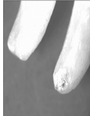
Figure 5: Stereomicroscopic image for determining actual working length

Tukey's honestly significant difference test was done and the results are shown in Tables 1 and 2.