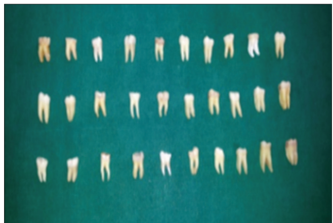
Figure 1: Sample size

The mean and standard deviations of the differences between CBCT 3D, RVG and CBCT 2D were calculated. ANOVA test was done and comparison was done between the groups and within the group.