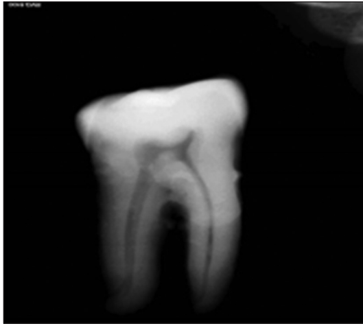
Figure 2: Working length determination in group 1 (RVG)