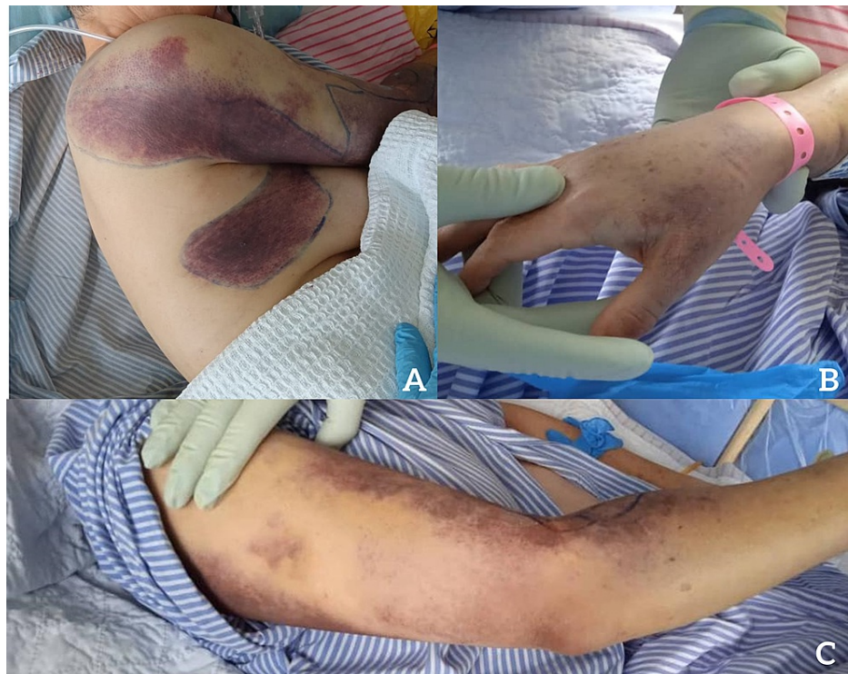
FIGURE 2: (A) Right lateral view showing the extension of the ecchymosis to the upper back of the patient; (B) purpuric rash on the dorsal of the right hand; (C) purpuric rash on the medio-posterior of forearm.