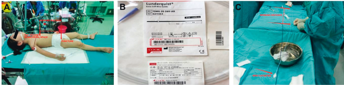
FIGURE 1: Measure the working distance: (a) the working distance is from the second intercostal space to the puncture site; (b) 0.035/260 cm extra stiff wire guide; (c) the MPA1 catheter marks the working distance.