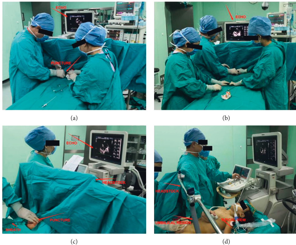
FIGURE 2: Percutaneous device closure of pediatric atrial septal defect through the femoral vein guided by transthoracic echocardiography without radiation: (a) in the operating room without radiological equipment, right femoral vein puncture point; (b, c) procedure under the guidance of transthoracic ultrasound; (d) the headstock (red arrow) and the child's umbilical region (red arrow) are vertically parallel, which can help isolate the surgical area and the ultrasound area.

without radiation or intracardiac echocardiography remains questionable. This manuscript aims to study the procedure guided, only by transthoracic echocardiography. The selection of the sections for the occlusion of the ASD ensures the safety and efficiency of the implementation of this new technology.