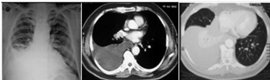
Figure 1. Chest X-ray and computed tomography (CT) of the patient showing right-sided pleural effusion with collapse of right lower lobe.

Chyle is a bacteriostatic milky body formed in the intestine that contains chylomicron, triglycerides, and lymphocytes. The effusion may be unilateral, mostly on right side in 50% of cases, left side in 33% while bilateral in 17% cases. It is dependent on the site of the leak. Chylothorax is an exudative effusion and almost 50% of them are blood stained and the rest half have a classic milky appearance