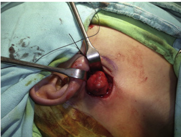
Figure 2 Encapsulated mass with a well-defined margin was identified and excised from the posterior neck.

The preoperative differential diagnosis included a heterotopic salivary gland tumor, neck lymphadenopathy, a cyst, and, less likely, a malignant tumor. An excisional biopsy was planned and was carried out under general anesthesia. Intraoperatively, the skin flap was elevated along the posterior border of the mass. The lesion was found to be solitary and deep in the investing layer of the deep cervical fascia without sinus tract formation. The mass was easily dissected from the surrounding fascia and was completely excised from the neck (Fig. 2). The specimen was a firm, well-encapsulated tumor, measuring