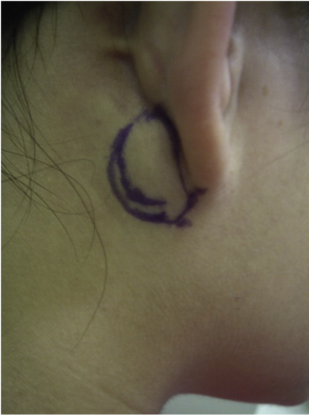
Figure 1 Painless mass measuring 3 × 2 cm with intact overlying cervical skin in the postauricular region.

The preoperative differential diagnosis included a heterotopic salivary gland tumor, neck lymphadenopathy, a cyst, and, less likely, a malignant tumor. An excisional biopsy was planned and was carried out under general anesthesia. Intraoperatively, the skin flap was elevated along the posterior border of the mass. The lesion was found to be solitary and deep in the investing layer of the deep cervical fascia without sinus tract formation. The mass was easily dissected from the surrounding fascia and was completely excised from the neck (Fig. 2). The specimen was a firm, well-encapsulated tumor, measuring