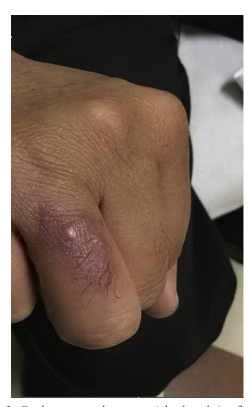
Fig 3. Erythematous plaque on right dorsal ring finger.

rainfall, which California experienced this year. Additionally, there have been recent reports of patients in eastern Washington state who acquired coccidioidomycosis without any travel history. <sup>11,13</sup> Subsequent studies of soil samples collected in that region confirmed the presence of C immitis , reflecting the changing demographics of endemic diseases in the Unites States. <sup>14,15</sup>