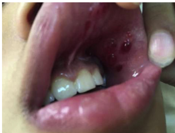
Figure 2: Severe oral mucositis with haemorrhagic vesiculobullous eruptions.