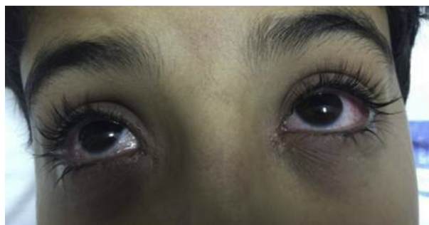
Figure 3: Moderate conjunctivitis in both eyes.

influenza viruses. Serology for M. pneumoniae IgM and M. pneumoniae PCR were both positive. An enzyme-linked immunosorbent assay (ELISA), also known as an enzyme immunoassay (EIA), is a biochemical technique used mainly in immunology to detect the presence of an antibody or an