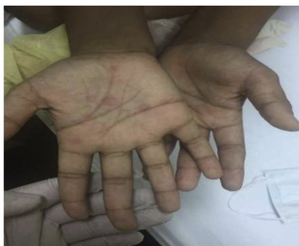
Figure 4: Multiple targetoid skin lesions in the palms of both hands.