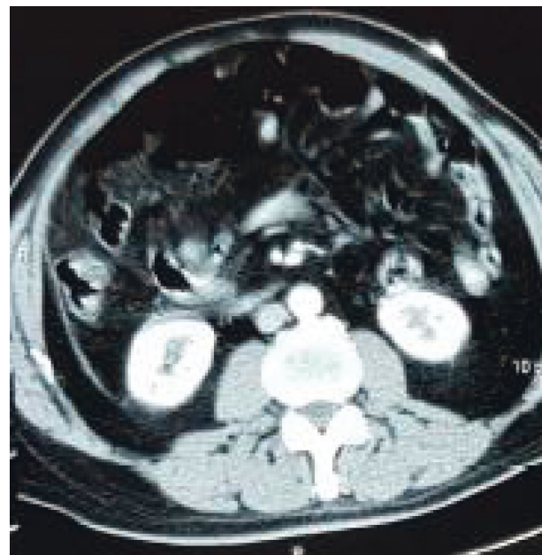
FIGURE 2: Abdominal CT scan: nonconclusive finding.

and tends to aggregate on the lipid membrane [14]. On the contrary, the direct bilirubin is water-soluble [15]. Therefore, the direct bilirubin increased its systemic concentration greater than indirect bilirubin, mimicking obstructive-type jaundice in this patient.