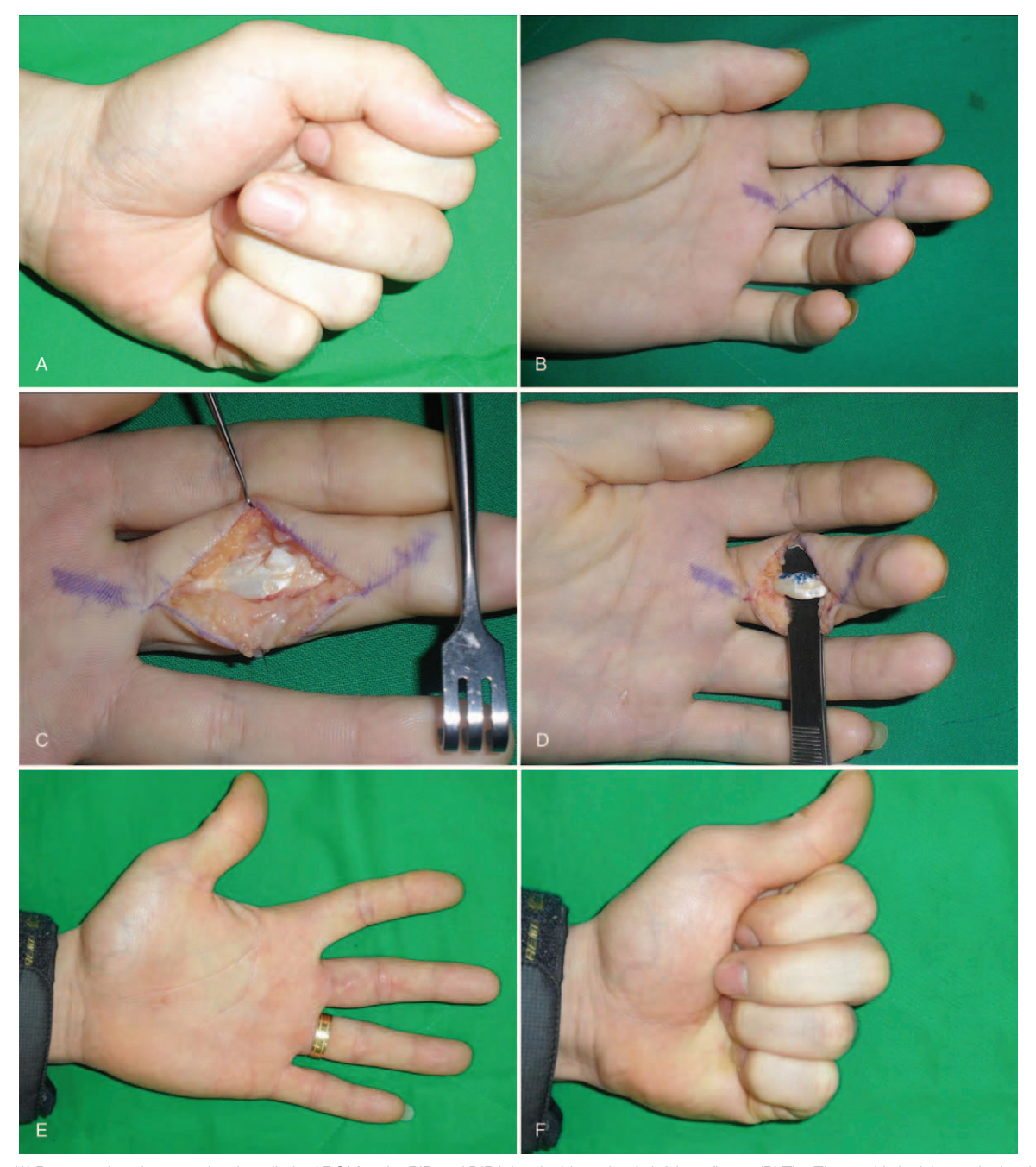
Figure 2. (A) Preoperative photographs show limited ROM at the PIP and DIP joints in this patient's left long finger. (B) The Zigzag skin incision at the level of the A2 to A3 pulleys. (C) Intraoperative photographs show partial radial side laceration of the FDP tendon after excision of the C1 and A3 pulleys. (D) Sutured tendon after trimming. (E and F) At follow-up 16 months later, the patient had regained nearly normal ROM in his left long finger without triggering. DIP=distal interphalangeal, FDP=flexor digitorum profundus, PIP=proximal interphalangeal, ROM=range of motion.

caused by the impingement of the proximal or distal edge of the lacerated tendon at the flexor tendon sheath. We found bulbous scar formation caused by bunched of tendon fibers at the laceration sites in 5 patients, and tenosynovitis was found in all patients. We think that one of the causes of the swelling and tenderness in the fingers was the unrestricted mobilization of the fingers without knowledge of the tendon injuries.