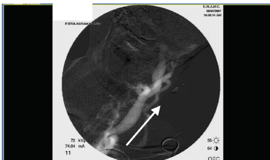
Fig. 1. (a) After passing through the cavernous and intercavernous sinuses, there is now antegrade flow (white arrow) down the right internal jugular. The obstruction is marked at the brachiocephalic vein by a striped arrow. (b) There is retrograde flow (white arrow) up the left internal jugular from the obstruction.

(CHF) and after the ingestion of tetracycline and vitamin A [3]. Clinical clues that may have suggested raised intracranial pressure in our patient included bilaterality and headache [4]; however, the mild headaches that our patient suffered resolved quickly, and the absence of pulsatile tinnitus, bradycardia and hypertension and the presence of venous pulsations were in agreement with the diagnosis of normal intracranial pressures on CT examination.