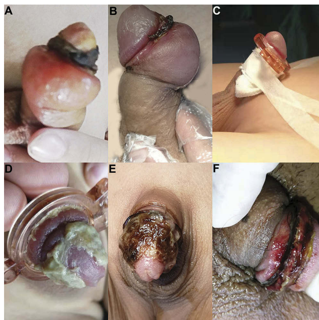
Figure 2 The types of complication. Edema and scar (A), edema in the back side of penis (B), pressure dressing (C), effusion of yellowish fluid caused by phimosis when wearing CSR (D) and CSR removal (E) and wound dehiscence (F).

not exist. In addition, patients with phimosis had lower satisfaction and higher incidence of complications than patients with redundant foreskin. For example, the incidence of total complications in phimosis was three times that of the redundant foreskin. Besides, the logistic regression results showed that age and sizes of the penis were