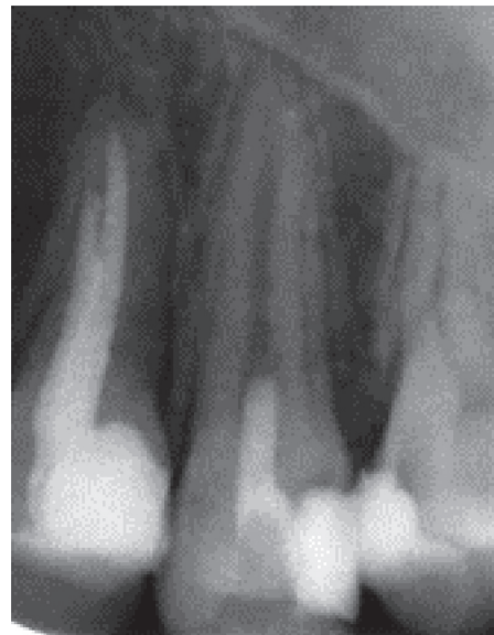
FIGURE 2: Postoperative radiograph presenting placement of the MTA and glass ionomer cement.

mature permanent tooth. Apical bleeding was induced into the root canal, leading to a suitable environment for pulp regeneration with an enrichment of host endogenous stem cells and growth factors in a bioactive scaffold. The new-grown tissue was not a pulp tissue revealed by the calcified shadows in the root canal. Instead, it might be a newly generated cementum-like tissue termed herein “intracanal cementum” as reported in relevant literature [8].