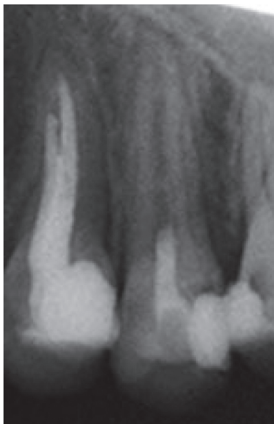
FIGURE 4: Six-month follow-up radiograph showing narrowing of the canal space with radiopaque shadows.