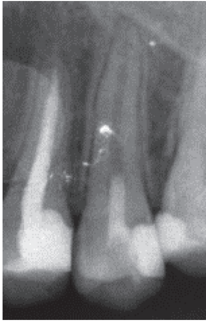
FIGURE 3: Three-month follow-up radiograph showing a normal periodontal ligament space.