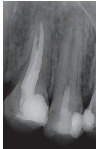
FIGURE 6: Thirty-month follow-up radiograph showing a normal periapical image.

His early research revealed tissue repair (fibroblasts, collagen, and sparse vascularity) without histologic evidence of regeneration of the pulp-dentin complex, while a newly mineralized tissue appeared to be cementum was evident on some dentinal walls. The second case series 10 years later showed histologic evidence of an ingrowth of vascularized fibrous connective tissue in the most of the teeth. Wang et al. [8] analyzed the histologic characterization of regenerated tissues in the canal space after the revitalization/revascularization