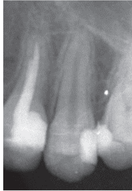
FIGURE 1: Preoperative radiograph showing a filling shadow close to the pulp and a fully developed root and closed apex of tooth #13.

Age of thirteen to fifteen years is the period of a premolar maturation, during which the apex is gradually closed. In this case, the patient was 15 years old. The X-ray showed that the apex was fully developed. Furthermore, during the regenerative endodontic treatment, a #15 K-file was used to probe the apical foramen and an obvious sense of friction was found, so we judged the tooth in this case belongs to