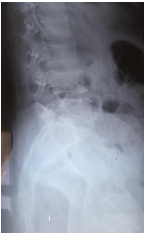
Figure 2: Biconcave vertebral bodies (fish vertebrae) and upper anterior fracture of the 5 th lumbar vertebra osteophyte

To avoid malabsorption of vitamin D due to gastrointestinal lymphoplasmacytic inflammatory infiltrates, it was initiated Cholecalciferol (vitamin D 3 ) i.m. 300 000 UI at once, followed by vitamin D 3 50 000 UI/per week oral solution and, calcium 1000 mg 1x1 daily together with dairy products for one month, then followed with 25 000 UI/per week oral solution for other two months. Appropriate sun exposure in daily bases was recommended and other necessary treatment. Last three months, appropriate doses of Vitamin D were ordered in oral tablets.