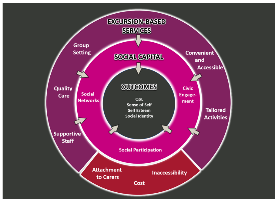
Fig. 3 Visual summary of the mechanisms in the program and its influence on individual social capital and outcomes including quality of life (QoL). Original image produced by the authors

Excursion-based programs can build social capital and improve older adults’ physical and social outcomes. Social capital theory posits that individual behaviours (e.g., community participation), norms (e.g., trust in community and reciprocity) and macrolevel mechanisms (e.g., historical, political, and economic aspects) can affect health status [8, 40]. The aim of the Community Connections program was to build community networks and participation, and opportunities for exchange, and results indicate that this contributed to maintaining participants’ social identity, confidence, quality of life, and sense of self-worth (see Fig. 3). Concepts of bonding and bridging social capital are also highlighted in our findings. Bonding