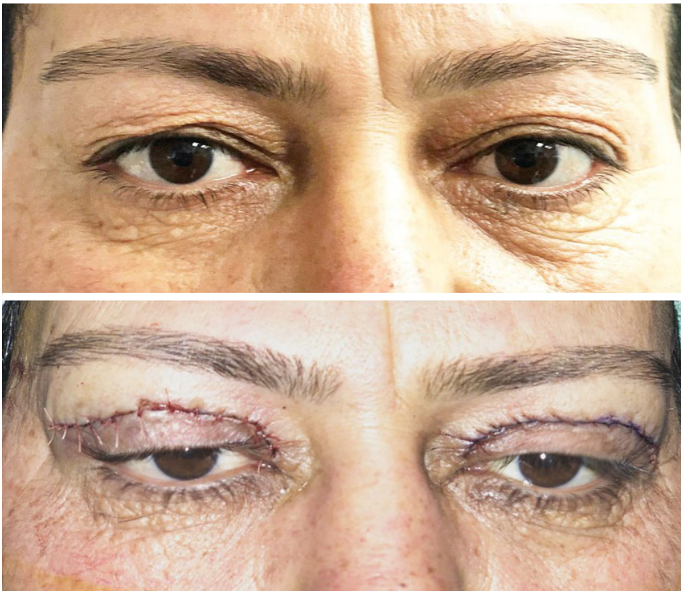
Figure 1. Preoperative and immediate postoperative image of a patient who has undergone upper eyelid blepharoplasty. The suturing was performed as interrupted in the right upper eyelid and running in the left upper eyelid.