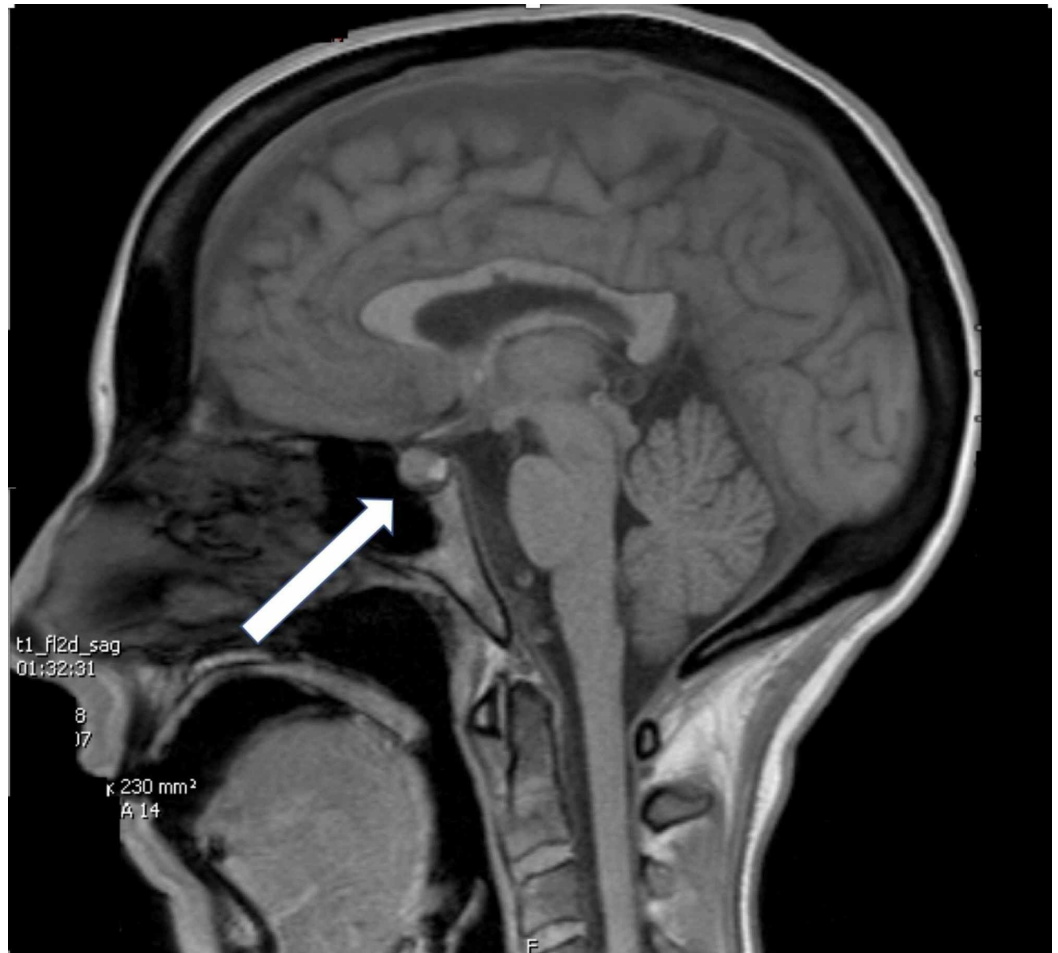
FIGURE 2: Sagittal view of head magnetic resonance imaging (MRI) depicting pituitary bulge (white arrow)