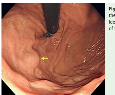
Fig. 2 A small subepithelial lesion (arrow) is identified at the fundus of the stomach.

went EUS-FNA with an FVCLA-ES (XGIF-UCT160 J-AL5; Olympus, Tokyo, Japan) were enrolled in this study. In all patients, small SELs were found incidentally during EGD for cancer screening. The existence of an SEL was confirmed by EUS with a mini-probe (20 MHz).