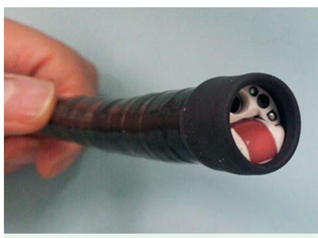
Fig.1 To solve the difficulty of tumor scanning and scope fixation during endoscopic ultrasound-guided fine-needle aspiration of a small gastrointestinal subepithelial lesion (SEL), a cap device is attached to the tip of a forward-viewing and curved linear-array echoendoscope scope tip; this device fixes the SEL.