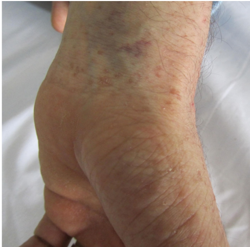
Fig.1. Maculo popular rashes on volar area of the pateint