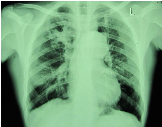
Fig.2. patient's chest X-ray