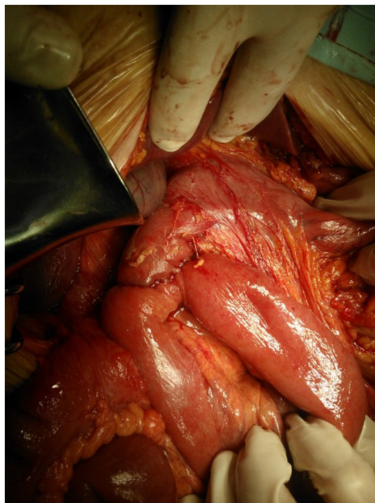
Fig. 3. Duodeno-jejunostomy.