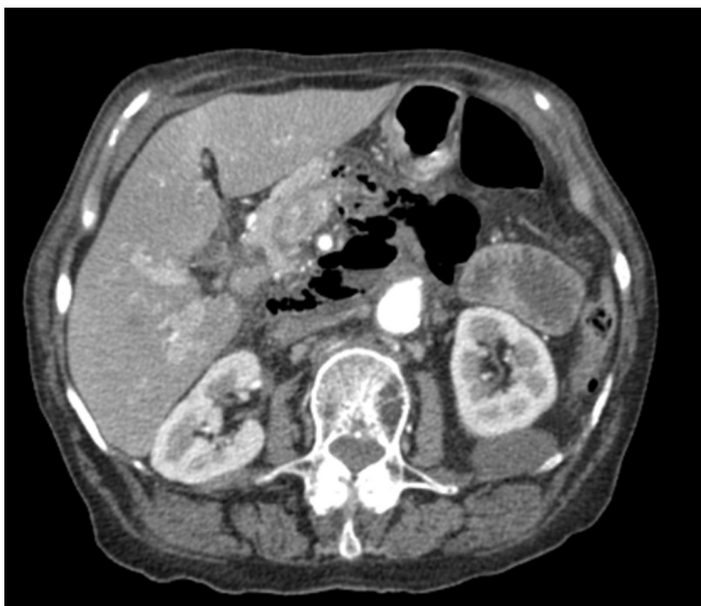
Fig. 1. CT scan evidencing a retroperitoneal perforation with retroperitoneal free air.

Abdominal X-ray showed no intra-peritoneal free air and computer tomography of the abdomen showed moderated extraluminal retroperitoneal gas (Fig. 1).