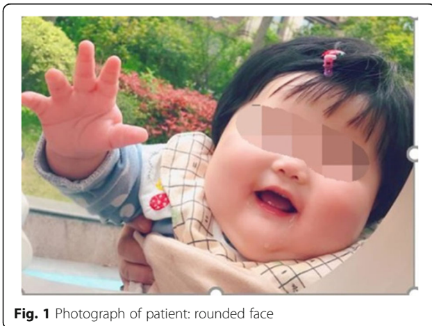
Fig. 1 Photograph of patient: rounded face

On her 15th months old, electroencephalogram (EEG) and brain magnetic resonance imaging (MRI) were performed without any abnormal findings. Audiometry, pediatric eye exam and echocardiogram were also unremarkable. A bone age of 3 years by skeletal age assessment. The Complete Blood Count (CBC) test, Complete Chemistry Panel (CMP) (including serum creatinine, blood urea nitrogen test, estimated glomerular filtration rate), thyroid function tests urinalysis, myocardial enzyme level (including troponin T, troponin I, creatine