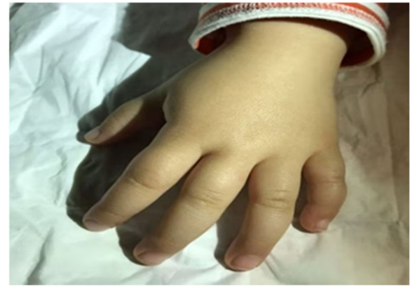
Fig. 2 Dysmorphic features of patient: large fleshy hands

kinase, lactate dehydrogenase), serum lactic acid and ammonia were all within normal range. Serum trace metal elements (including copper, zinc, lead and cadmium) were also unremarkable. Serum insulin-like growth factor-1 (IGF-1) was 174 ng/ml (normal 55 ~ 327 ng/ml), and insulin-like growth factor binding protein-3 (IGFBP-3) was 5.07 µg/ml (normal 0.7 ~ 3.6 µg/ml). Chinese version of GDS (Gesell Development Scale) was used as neuropsychological development examination, and Infant development was assessed using the development quotient (DQ) according to the following criteria: normal (DQ ≥ 85), borderline (75 ≤ DQ < 85) and abnormal (DQ < 75). The girl had DQ of 58 for “gross motor”, 63 for “fine motor”, 54 for “language”, 57 for “adaptive behavior” and 66 for “personal-social”. The results showed the girl had global developmental delay.