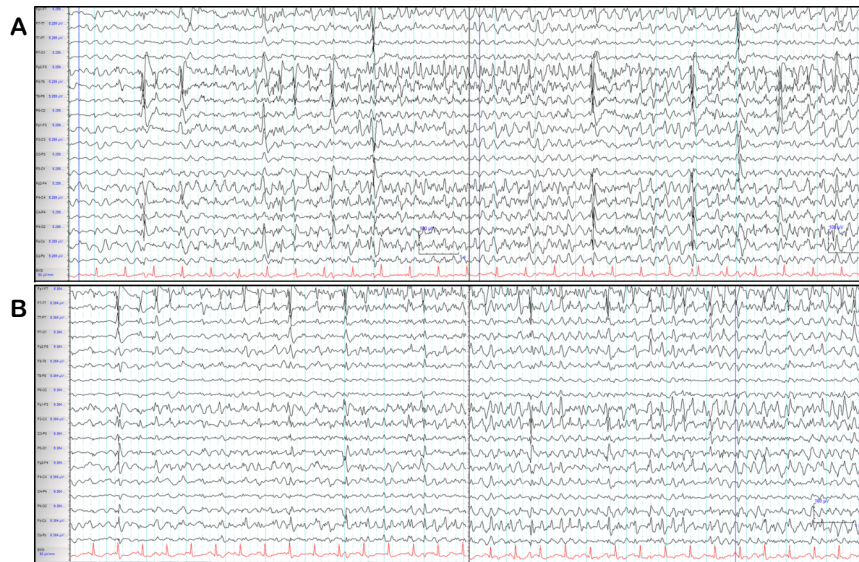
Figure 1. Electroencephalogram (EEG) showing seizures arising from the right or left fronto-temporal area. (A) The EEG seizure starts as repetitive sharp waves at the right anterior temporal area evolving to irregular theta rhythm and then to spike-wave mixture at right fronto-temporal areas where they were recorded. (B) Periodic sharp waves at the left anterior temporal areas were observed which progressed to a spike-wave mixture at the left frontal area and irregular theta rhythm in the left hemisphere.

IV anesthesia was administered for a total of 9 days, after which