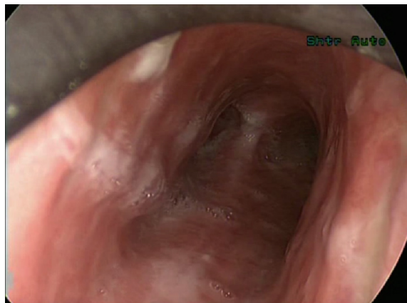
Figure 2 Bronchoscopic findings after chemotherapy and radiotherapy.

Primary tracheal malignancies are rarely observed, as they most commonly result from direct spread of neighboring tumors. SCC along with adenoid cystic carcinoma make up approximately two-thirds of adult primary tracheal tumors, with an incidence of approximately 0.1 in every 100,000 persons per year. 1 Recurrent respiratory papillomas are benign tumors caused by HPV types 6 and 11, with an incidence of 1.8 in every 100,000 persons per year. 2,3 They usually occur in children <5 years (juvenile-onset RRP), and less commonly in elderly patients between the 3rd and 4th decade of their lives (adult-onset RRP). 1 RRP malignant degeneration