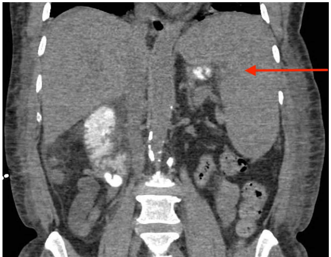
FIGURE 1: Coronal section of CT abdomen revealing splenomegaly of 17 cm (red arrow).

Initial infectious workup, including blood cultures, urine analysis, and chest x-ray, was negative. Further infectious workup with atypical/viral panel, Epstein-Barr viral capsid antigen antibodies, hepatitis viral panel, human immunodeficiency virus (HIV) antibodies, Mantoux test, acid fast bacilli cultures, fungal cultures, urine histoplasma antigen, and cytomegalovirus IgM antibody were all negative. Imaging including transthoracic echocardiogram and transesophageal echocardiogram showed no abnormalities. CT of the abdomen revealed splenomegaly of 17 centimeters (cm) (Figure 1). Antibiotics were then discontinued as infectious workup was negative.