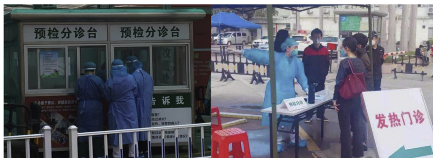
Figure 1 Triage nurse with personal protective equipment including medical mask, cap, medical grade gloves, and protective goggles in the main entrance of a facility.

Before their appointment in a health care facility, patients are screened at a screening checkpoint to determine whether they are exhibiting signs of a SARS-CoV-2 infection. Triage nurses are available to assess and help individuals at the main entrance outside of facilities and in the reception area of facilities. They may need to help answer patient questions about the virus, and issue up-to-date visiting notices (Fig 1). They must wear personal protective equipment including masks, caps, latex gloves, protective goggles or face shields, disposable waterproof